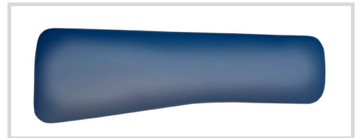
Comfort-form arm accommodates both arm and hand for a more relaxed draw.